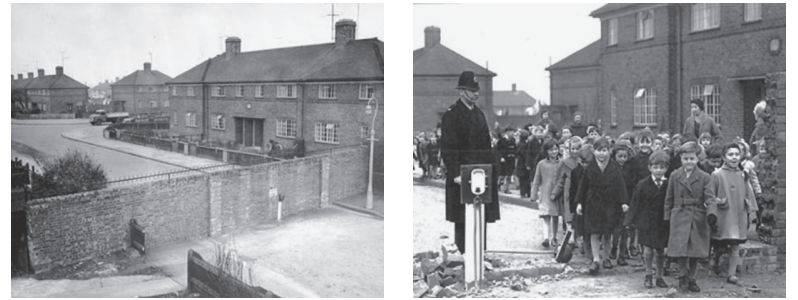
One of the Cutteslowe Walls: (left) standing, and (right) demolished.